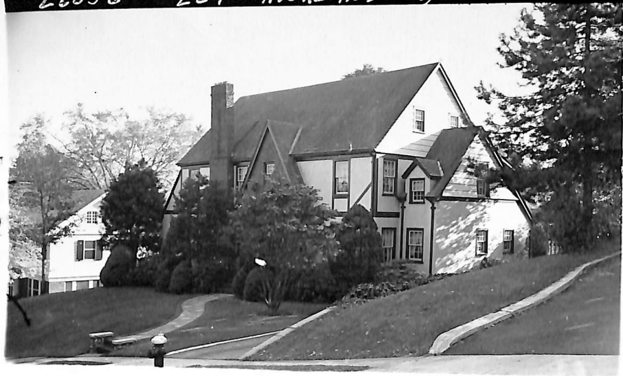
Board of Realtors of the Oranges and Maplewood