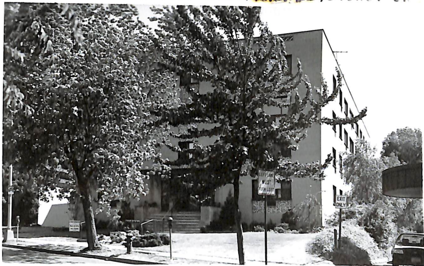
Board of Realtors of the Oranges and Maplewood

61157 116 IRVINGTON AVE., ADVISORY , S.ORG. CK