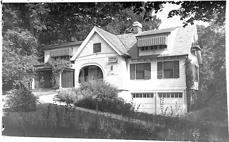
Board of Realtors of the Oranges and Maplewood