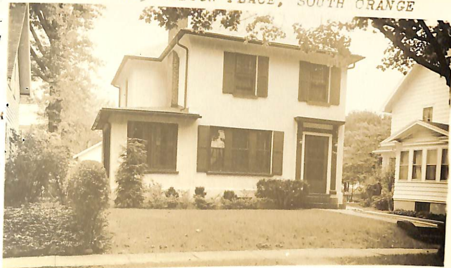
Board of Realtors of the Oranges and Maplewood