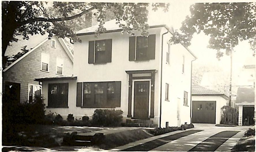
Board of Realtors of the Oranges and Maplewood