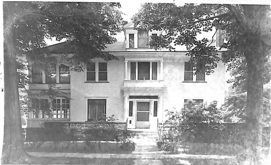
Board of Realtors of the Oranges and Maplewood