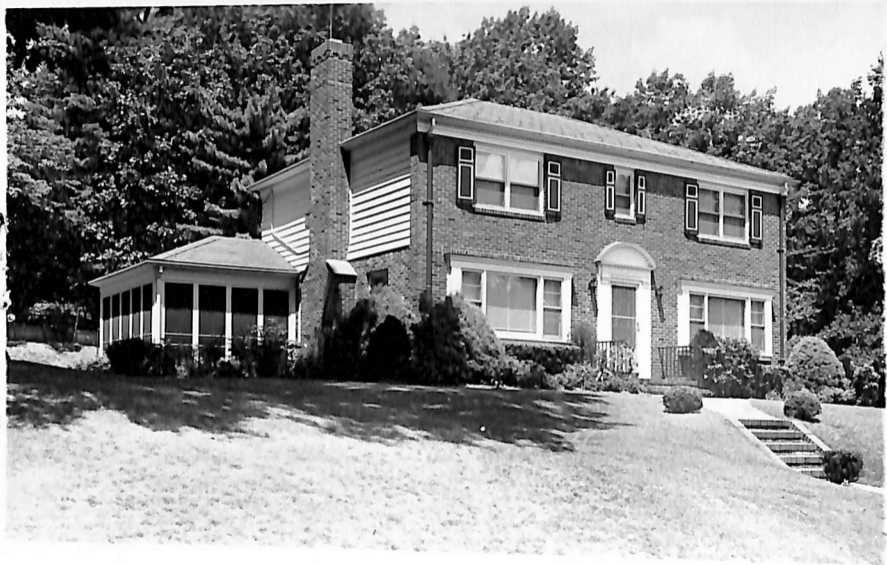
Board of Realtors of the Oranges and Maplewood Photo L. C. B. B. B.